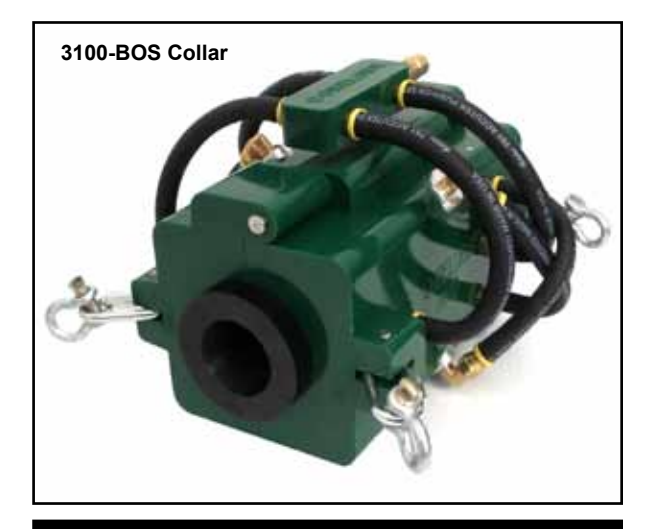
Accommodates Wire Rope Sizes From: .472" (12mm) to 3" (76mm)