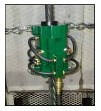
Mine Hoist Rope