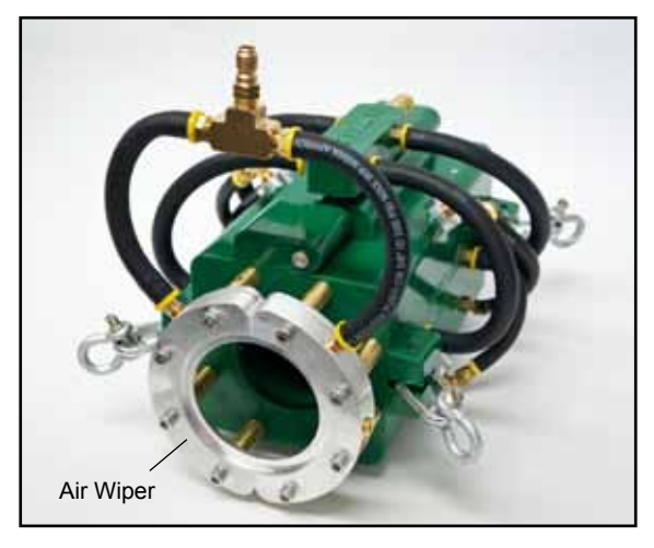
Air Wiper Option Available

FIGHT CORROSION by keeping the wire ropes clean.