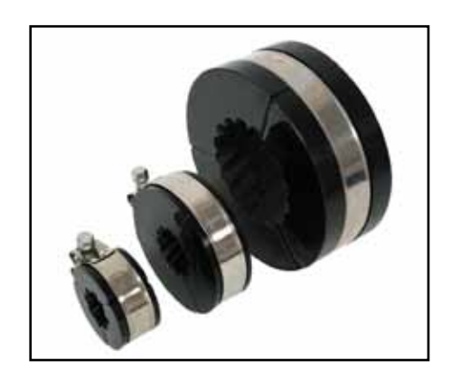
Small, Medium & Large Helix Groove Cleaners Available up to 5." (127mm)

Number of outer strands available: (3 Outer Strands) to (18 Outer Strands)