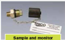
Sample and monitor fluids without shutdown