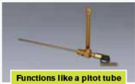
Functions like a pitot tube with easy viewing of fluids

Pitot Tubes are designed to provide a safe, simple and effective method of sampling fluids from sumps and non-vented horizontal drain lines. They ensure oil samples are drawn from the most appropriate location of the sump reservoir, and that the sample is taken from the exact location inside the system each time, which is important for maintaining consistency in routine sampling.