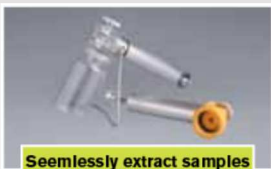
Seamlessly extract samples from the sample port

Liquid Level Gauge Sample Ports offer the same sample benefits as pitot tubes however they provide easy viewing of the fluid level and condition. They are ideal for bearing housings and other non-pressurized applications.